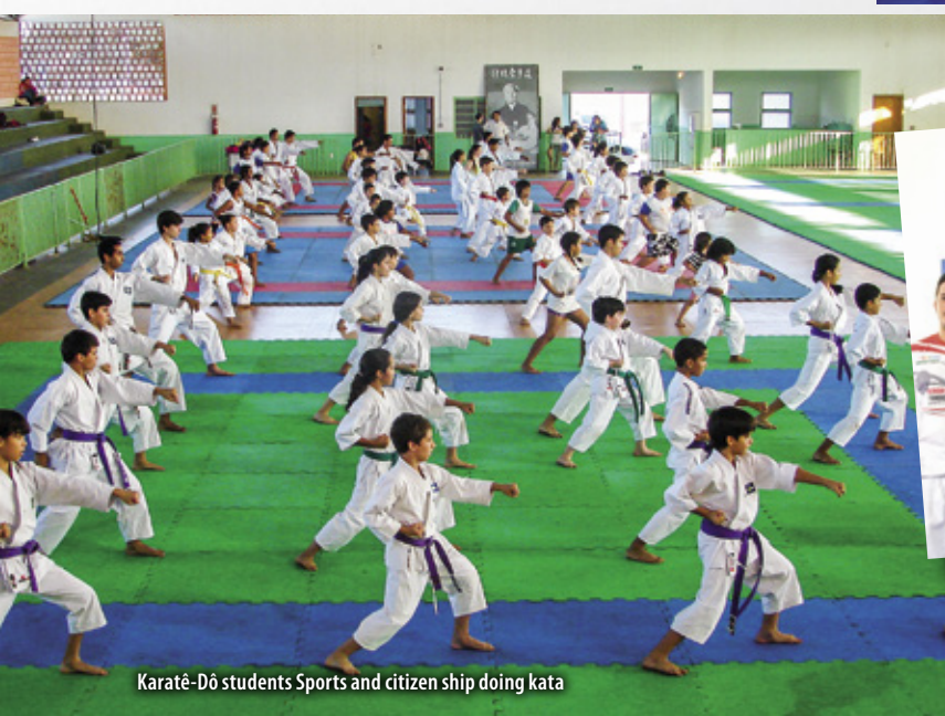
Karatê-Dô students Sports and citizen ship doing kata