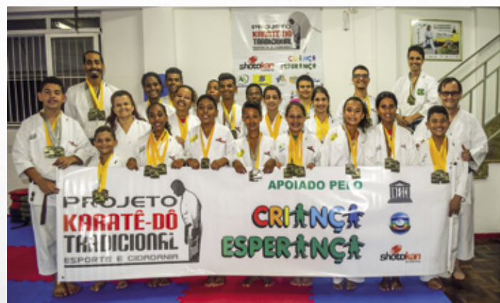
Shotokan athletes and the project with the medals won in the Brazilian champions hip held in Natal (RN) in 2016