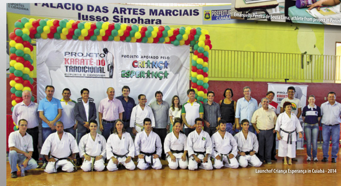
Launch of Criança Esperança in Cuiabá - 2014