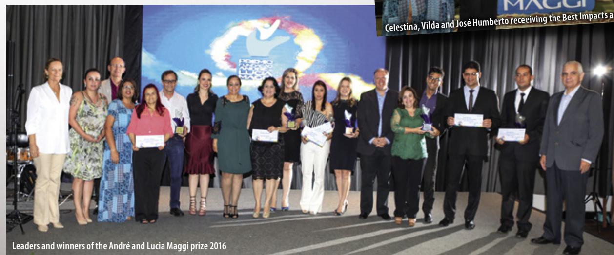
Leaders and winners of the André and Lucia Maggi prize 2016