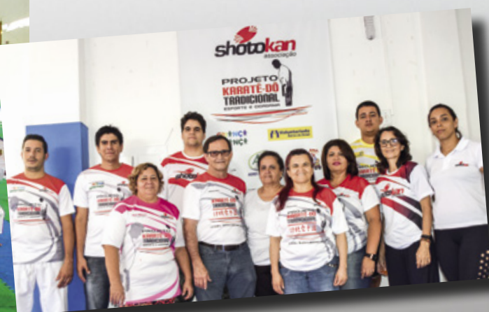
Shotokan staff and volunteers-----