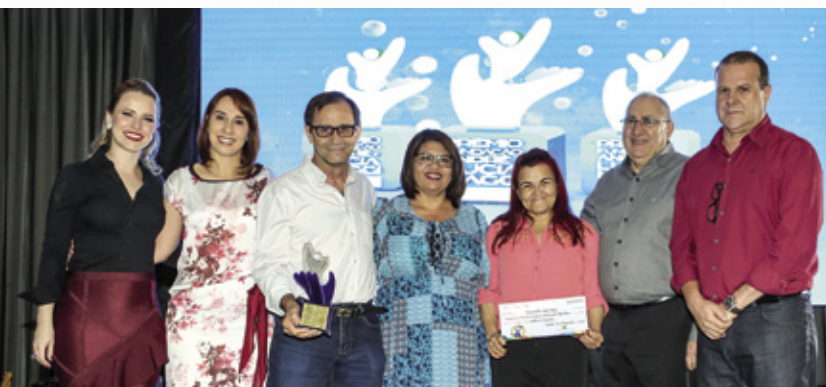
Members of the teams André And Lúcia Maggi and Shotokan Association