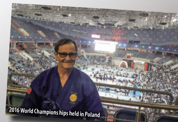
2016 World Champions hips held in Poland