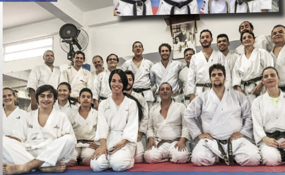
Shotokan Athletes and Students with the team in "Fantástico" 2015